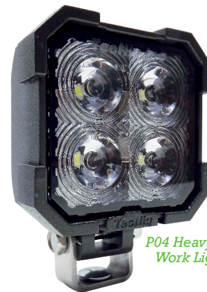
P04 Heavy Duty Work Lighting

In the Agricultural markets high quality materials can set you apart from your competitor. We incorporate automotive grade polycarbonate lenses for crack and chip resistance, FR4 military grade circuit boards rather than paper like our competitor, and our own proprietary potting to assure our lights won't leak. All of this to keep essential equipment running, and downtime to a minimal